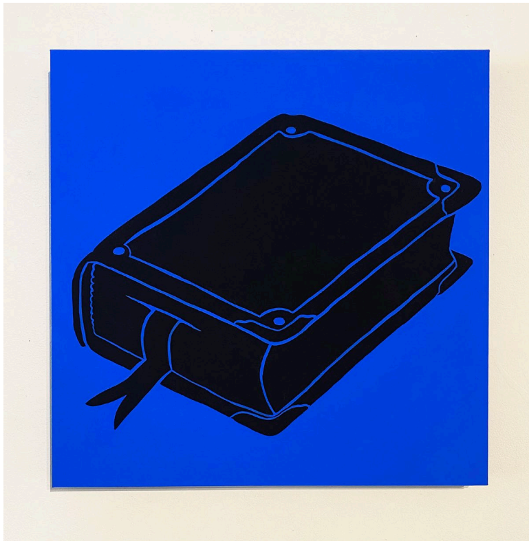
Desireé Vaniecia, Past Gatherings , 2020, Flashe on canvas, 24x24", $1,600.