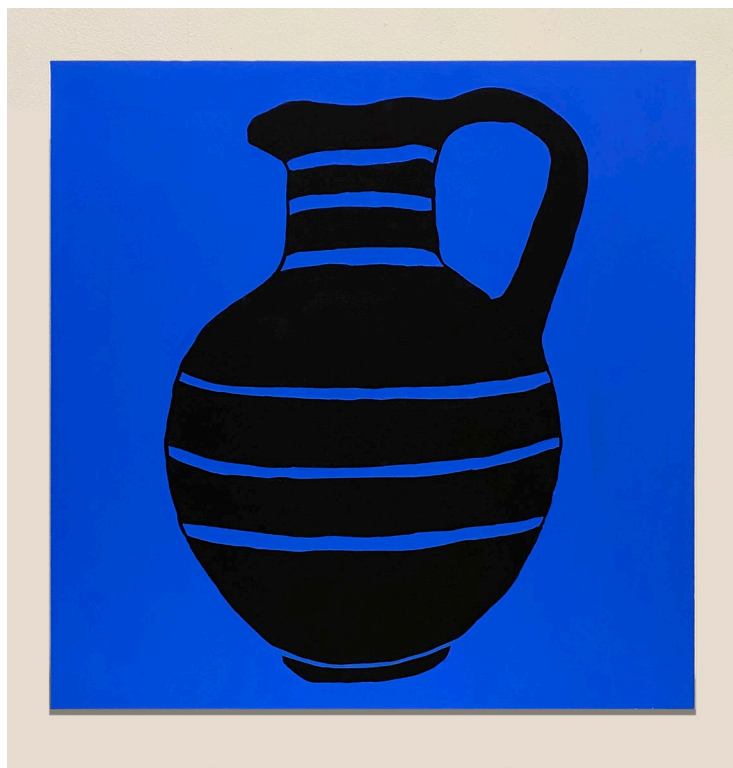
Desireé Vaniecia, Higher Wisdom , 2020, Flashe on canvas, 24x24", $1,600.