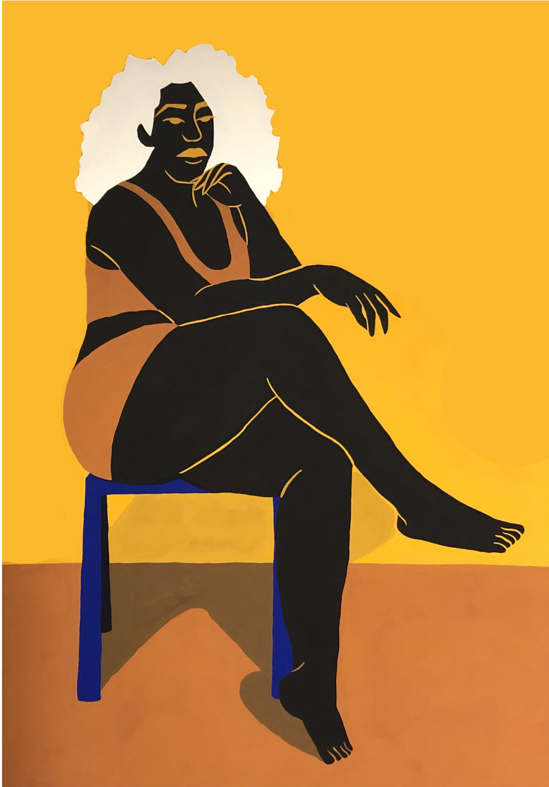
Desireé Vaniecia, The Payback , 2020, Flashe on canvas, 84x60", $6,500.