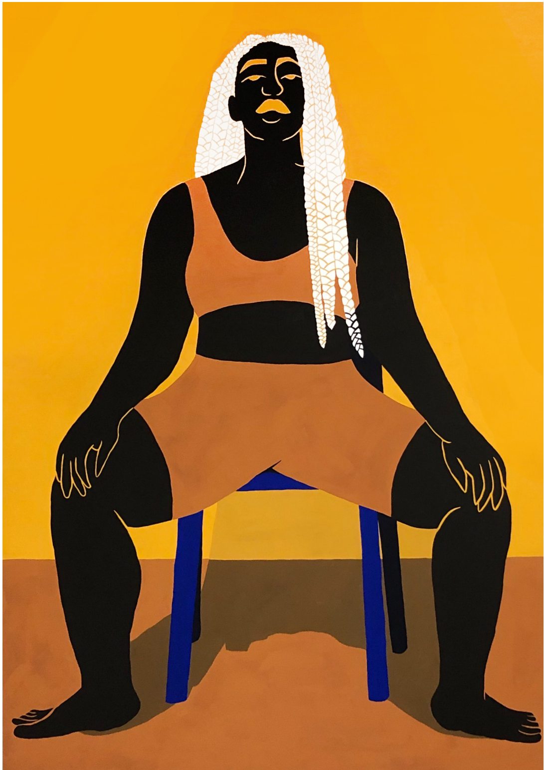
Desireé Vaniecia, East Texas , 2020, Flashe on canvas, 84x60", $6,500.