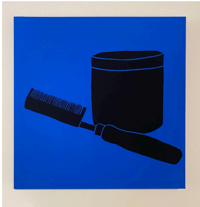
Desireé Vaniecia, Always Put Your Best Foot Forward , 2020, Flashe on canvas, 24x24", $1,600.