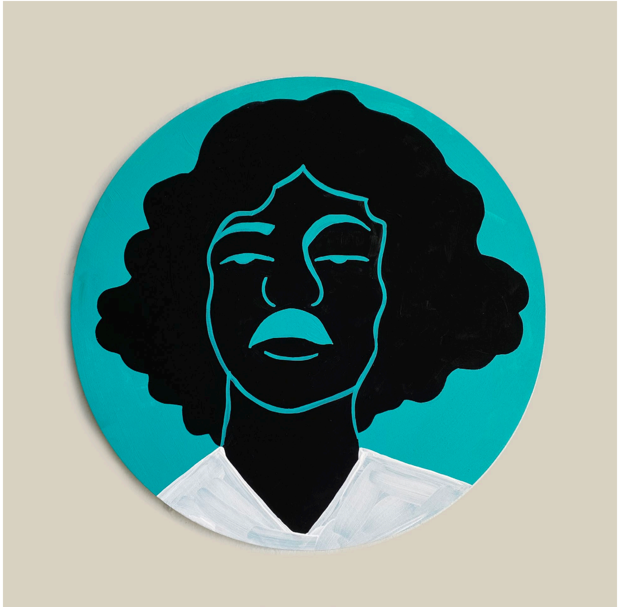
Desiree Vaniecia, Only time will tell Part 3 , 2020, Flashe & gouache on canvas, 12" dia., $800.