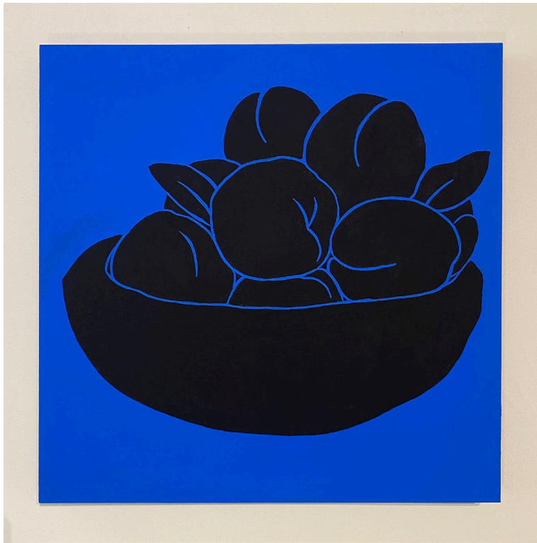
Desireé Vaniecia, H Gotta Get Done , 2020, Flashe on canvas, 24x24", $1,600.