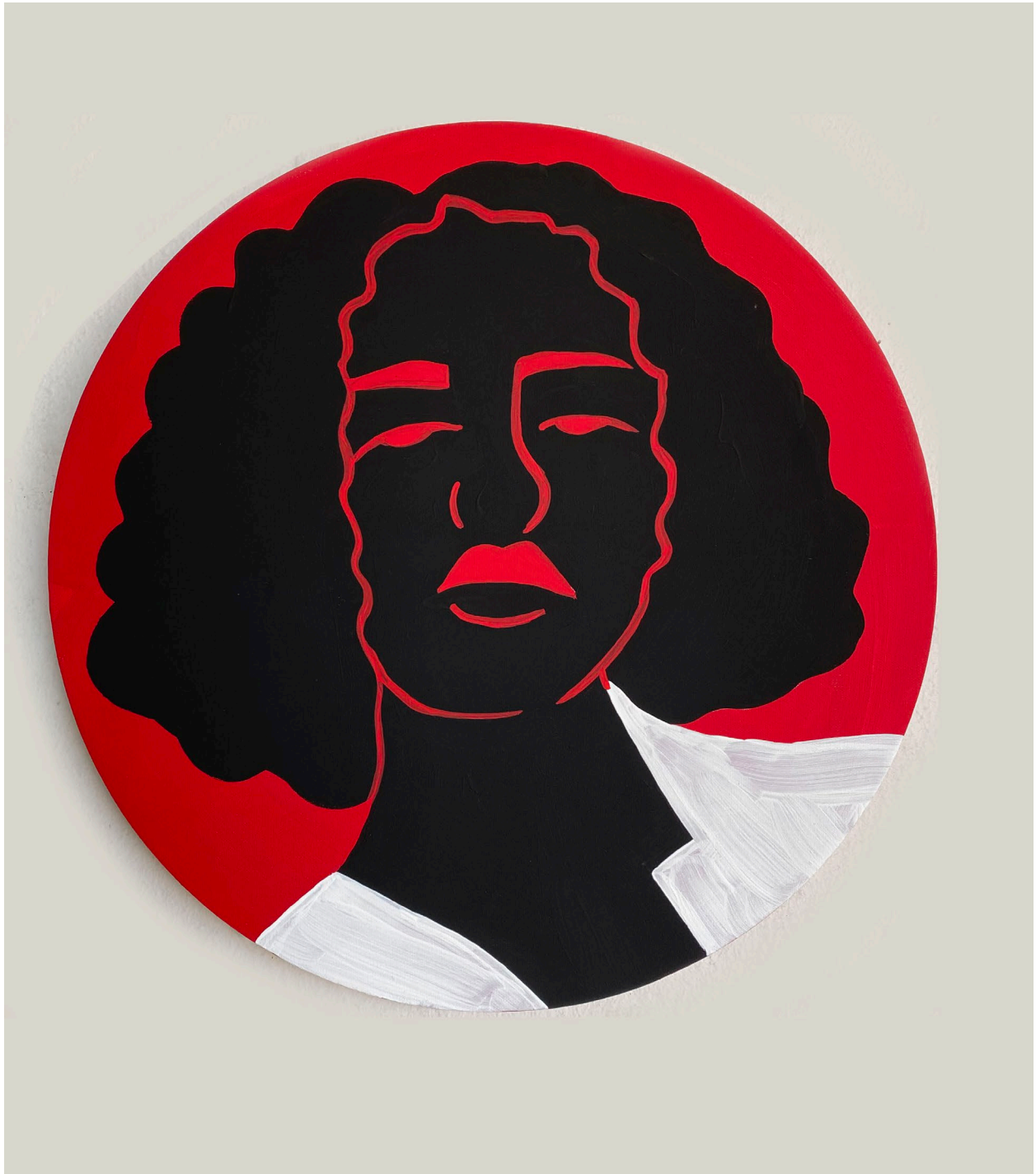
Desiree Vaniecia, Only time will tell Part 2 , 2020, Flashe & gouache on canvas, 12" dia., $800.