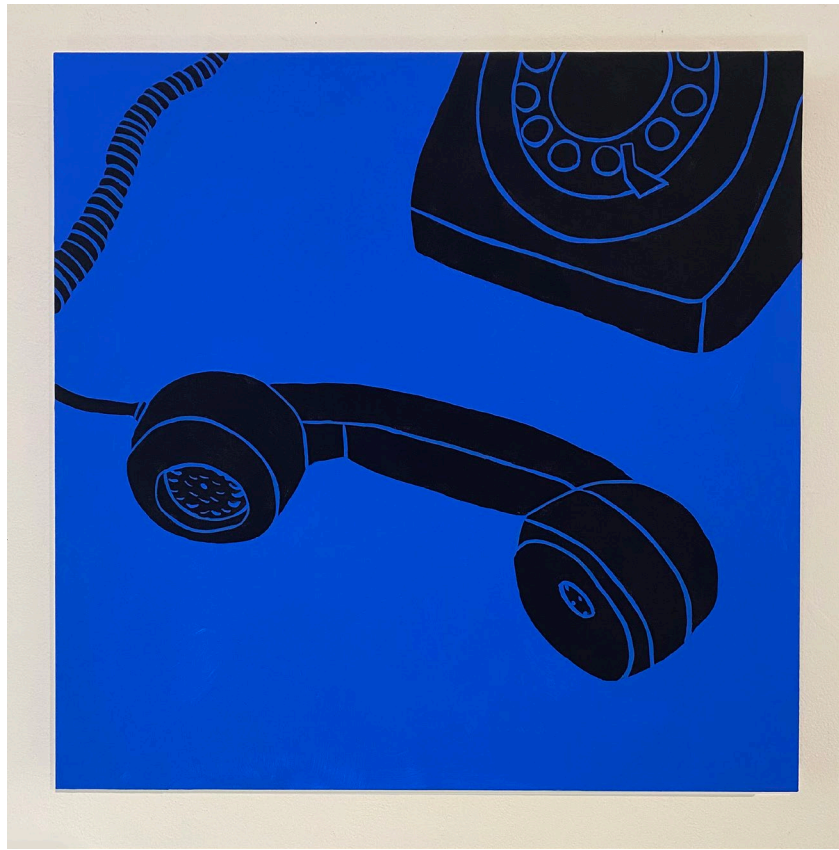
Desiree Vaniecia, Curses , 2020, Flashe on canvas, 24x24", $1,600.