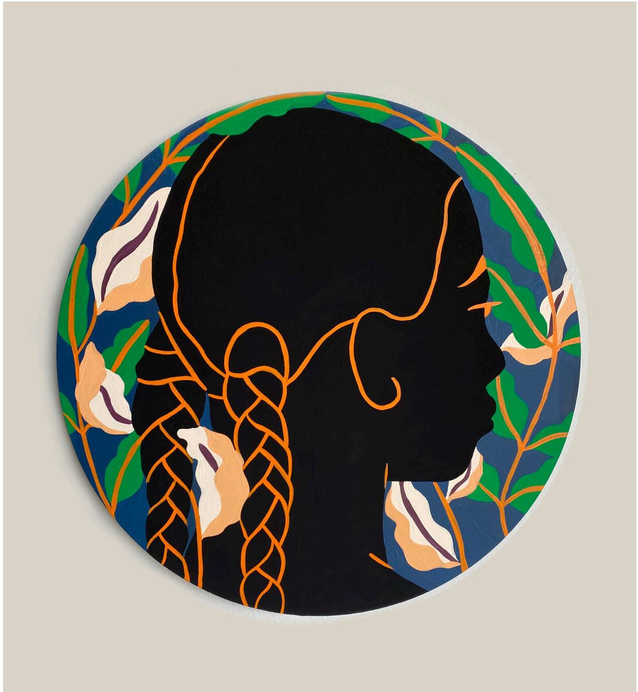
Desireé Vaniecia, There is Beauty in Asking for Help , 2020, Flashe & gouache on canvas, 18" dia., $1,200.