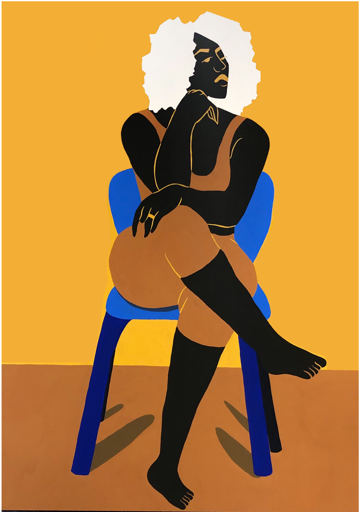
Desireé Vaniecia, Love and Happiness , 2020, Flashe on canvas, 84x60", $6,500.