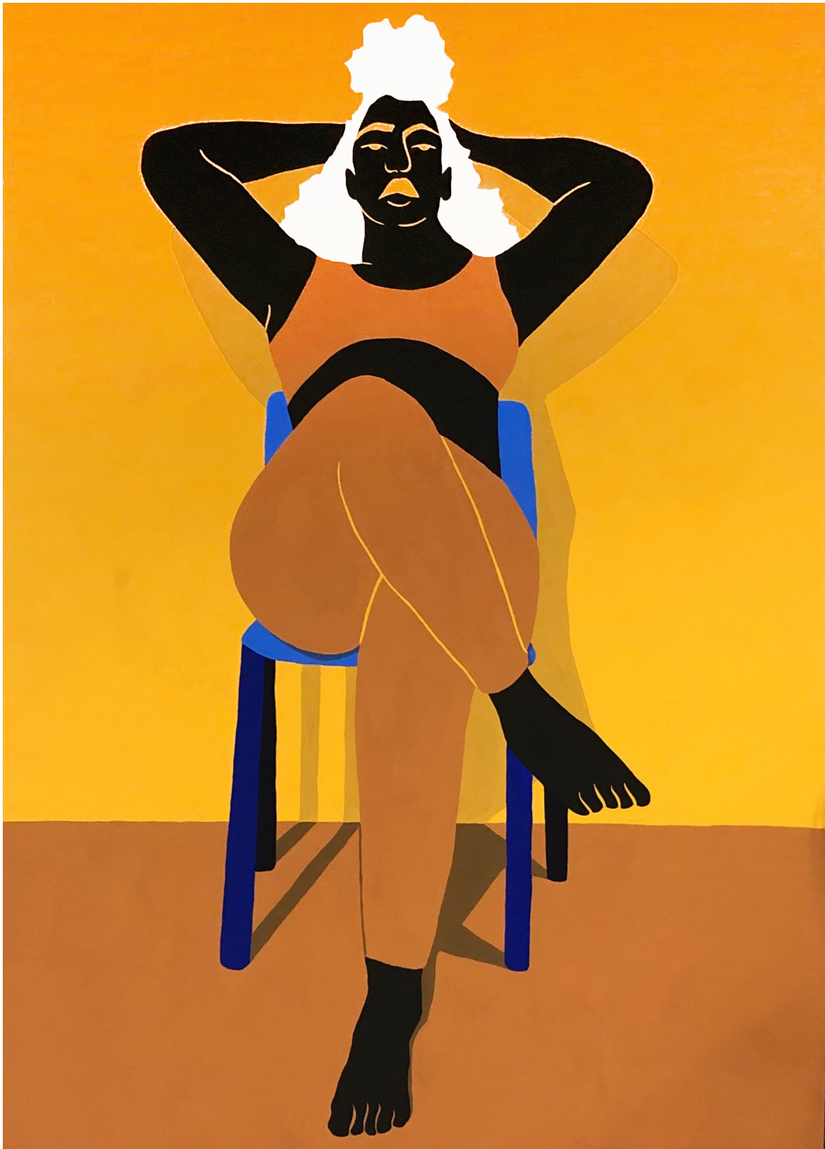
Desireé Vaniecia, What I Want Is , 2020, Flashe on canvas, 84x60", $6,500.