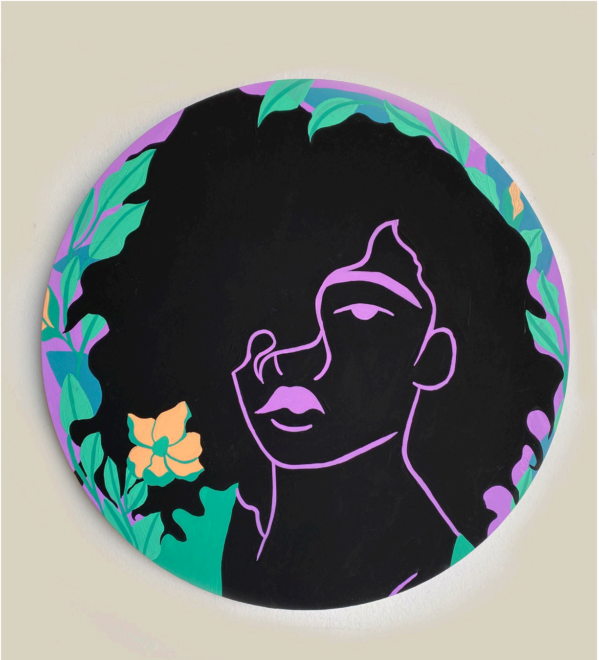
Desiree Vaniecia, I Wasn't Taught to Cry , 2020, Flashe & gouache on canvas, 18" dia., $1,200.