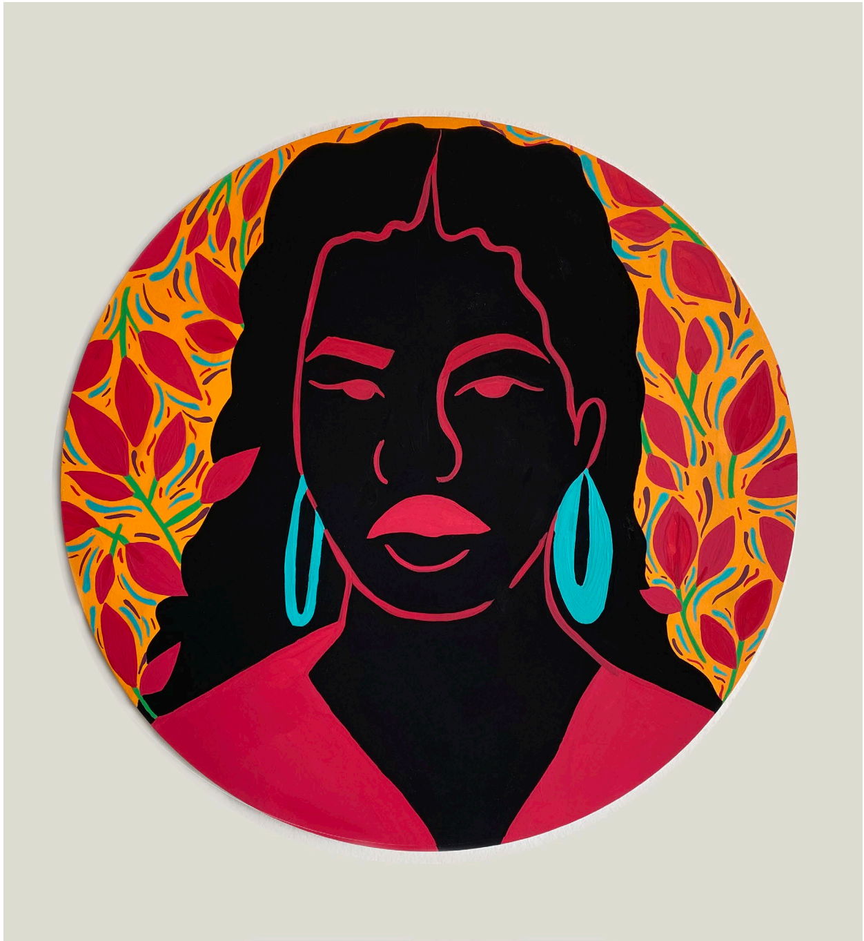
Desireé Vaniecia, Forgiveness is a Hard Thing to Do , 2020, Flashe & gouache on canvas, 18" dia., $1,200.